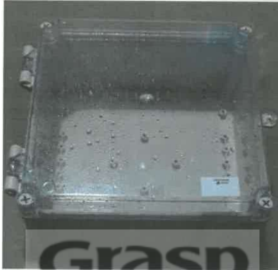
Sample image (After IPX7 Test)

Product Name : Polycarbonate Enclosure (280x280x130) Trade Mark : GRASP Grade : 943A Mfg. : Maharaja Plastic Industries Made in : India